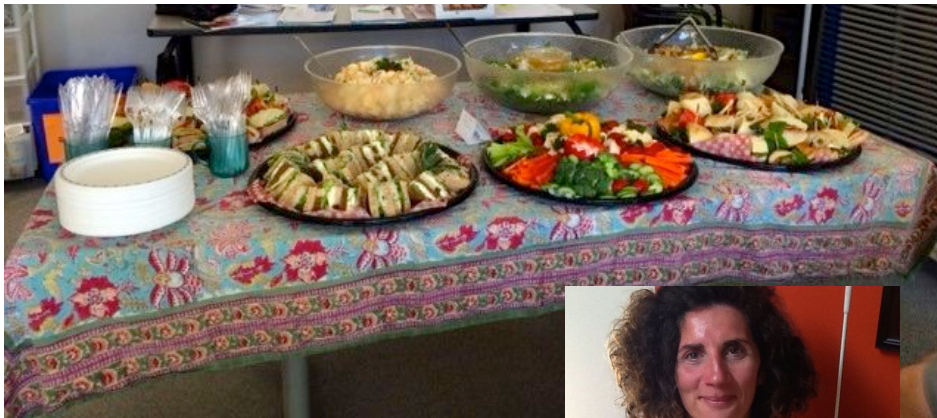
Staff and Teacher Appreciation Lunch - May 2015

New shelving is now available thanks to all of you who made donations or participated in the Mother's and Father's Day fundraiser activity.